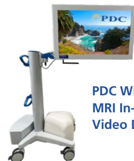
PDC Wireless, Recharging MRI In-Bore Viewing Video Display