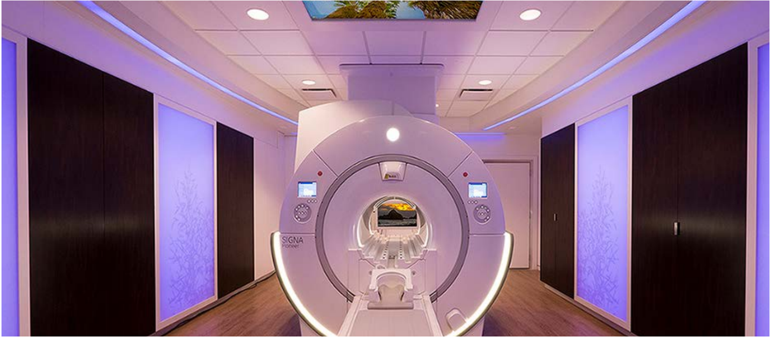
Head-First Scan - MRI Wireless Video Display is placed behind the bore. Patient uses mirror glasses, head-coil mirror or bridge mirror to see display

“They aren’t thinking about going in the tube, they are thinking about...the color, video and music. They like all of those different options.”