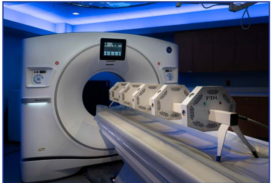
The UV-C System can be used on MR, PET/MR, CT, PET, PET/CT, MR-guided Linac, Nuc Med and any other imaging bore (60-80 cm)

UV-C LED Bore Disinfection System on the CT Table (System is OFF)