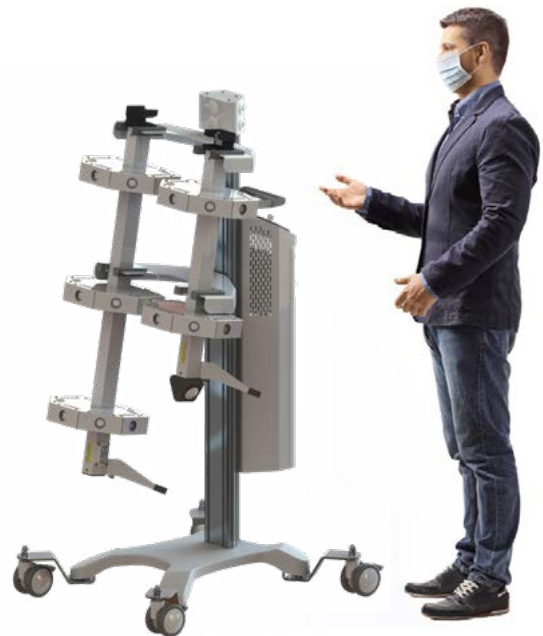
Transport and Storage Configuration

Current users report the UV-C Disinfection System is being used throughout the imaging department in CT, MR and PET after known COVID patients and as part of their normal cleaning routine. The device is easy to move around, set up and operate.